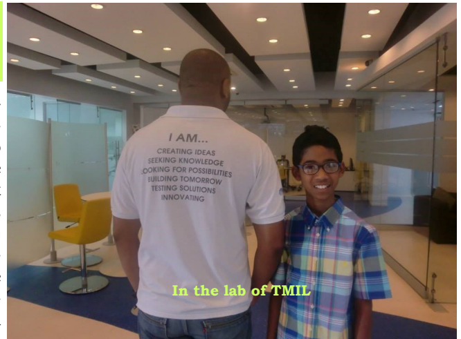
In the lab of TMIL

Career Day was initiated for the students of the St Bernadette School, an elementary school where the six most excellent students got a schoolbag from us. We wanted to do more than just give a bag so the students were given the opportunity to get a tour at their dream job to experience it and which road to follow to get the job. The first tour was at the Telesur Multimedia Innovation Laboratory (TMIL) which is an initiative of Telesur and is implemented in collaboration with the Anton de Kom University of Suriname (ADEKUS). TMIL should become THE place for entrepreneurial and creative talent in Suriname. The Innovation Lab is meant to serve as a creative incubator, a knowledge center and a laboratory. There are thinking and working areas available for research and experimentation.