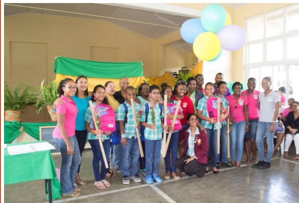
The awarded students (graduates) alongside Rotaract Club Genesis members and the school board

On August 14 th , graduation took place for elementary school students throughout the