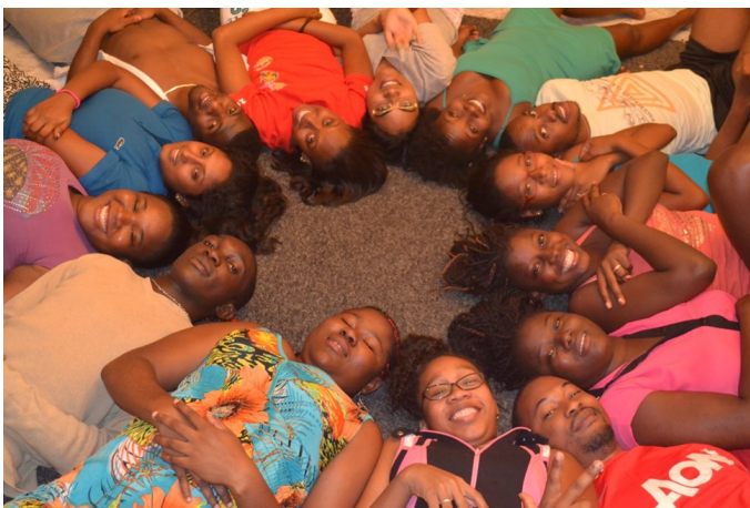
This is US from above

From the 5 th - 7 th of September 2014, the Club Service avenue organized a project named 'Fun and Learning Weekend'. The goal of this project was to empower our members and prospective members with knowledge regarding the elements of budgeting, have a retention and recruitment session for fellows, prospective members and guests. We also had activities and games to strengthen and engage interaction between fellows. During the retention and recruitment session we evaluated the performance of the club and the fellows came up with solutions and ideas to make the club function better. In the morning hours of Sunday three fellows decided to give us a zouk demonstration. It was so fantastic to watch that we asked the PM who teaches zouk to learn us a couple of steps. We were very excited to learn this dance. After these dance lessons some of the fellows decided to have a movie night. This project was a success and will contribute to great service year.