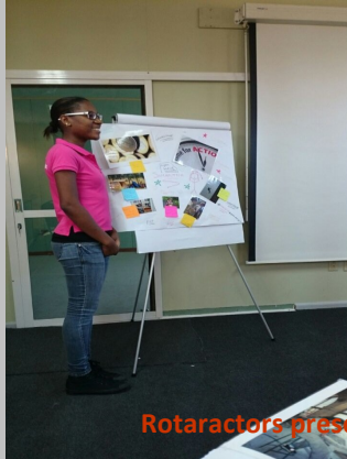
Rotaractors presenting their vision board