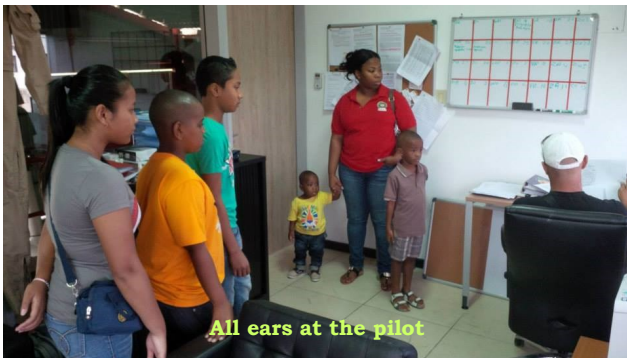
All ears at the pilot