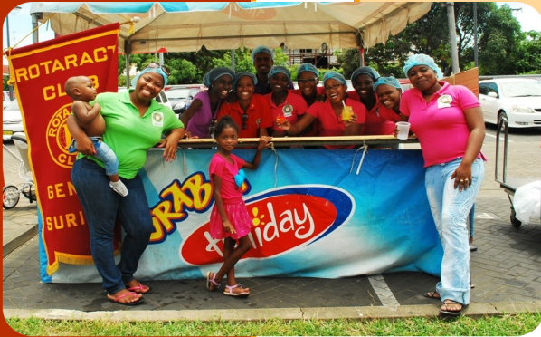
The Genesis crew after the sale

On July 26 th Rotaract Club Genesis organized their first project for the service year which was a bake sale. The bake sale was held at Choi's Supermarket from 8.00 till 13.00. After we put up our tent we sold snacks, cake, pancakes, cupcakes, cookies, salad, juice and ginger juice. The bake sale was well attended by our club members. It was a success. Our main goal was to raise money for our club fund and promote the club. We succeeded in these goals. We also encourage young people also to join the club. We had a great time with each other. In the future we will plan more bake sales, so our club fund can remain stable.