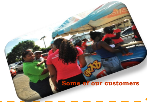
Some of our customers

On July 26 th Rotaract Club Genesis organized their first project for the service year which was a bake sale. The bake sale was held at Choi's Supermarket from 8.00 till 13.00. After we put up our tent we sold snacks, cake, pancakes, cupcakes, cookies, salad, juice and ginger juice. The bake sale was well attended by our club members. It was a success. Our main goal was to raise money for our club fund and promote the club. We succeeded in these goals. We also encourage young people also to join the club. We had a great time with each other. In the future we will plan more bake sales, so our club fund can remain stable.