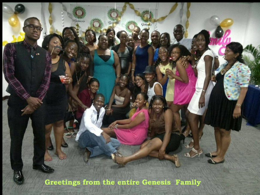
Greetings from the entire Genesis Family